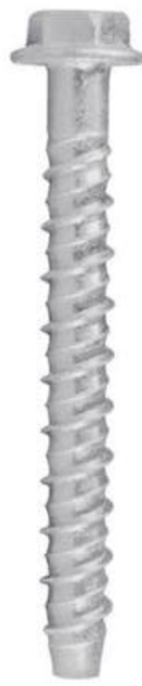
Hex Flange Head Bolt