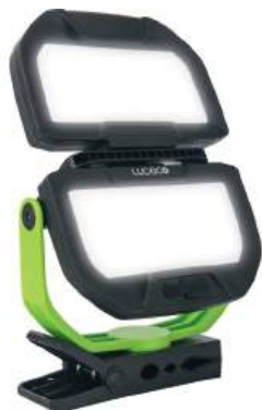
Twin Panel Folding Work Light (LILC250G65-01)

Choose from four light modes to match your needs. Adjust the head for precise lighting or 360-degree coverage. Mount the light on a tripod or easily attach to various surfaces with the strong magnetic base and clamp for more versatile use.