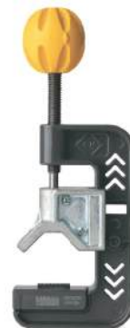
T2250 Armourslice SWA Cable Stripper

Innovative spiral design significantly reduces frictional resistance allowing for longer cable runs. Considerably less kinking and coiling compared to nylon and steel tapes.