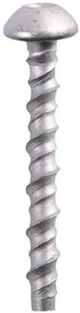
Pan Head Bolt