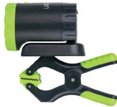
Mini Work Light (LILC50G65-01)

Choose from four light modes to match your needs. Adjust the head for precise lighting or 360-degree coverage. Mount the light on a tripod or easily attach to various surfaces with the strong magnetic base and clamp for more versatile use.