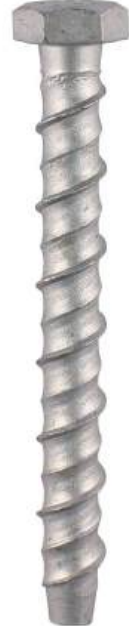
Hex Head Bolt

This stress free, non-expansion through fixing is the new solution for heavy duty anchoring into concrete, brick, stone, wood and concrete block.