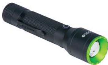
9W Hand Torch (LILHT100B65)

Three lighting modes offer up to 500lm. A strong clamp and magnetic base offer secure hands-free operation, ideal for close work in smaller spaces (boiler/fuse cupboards, engines, loft).