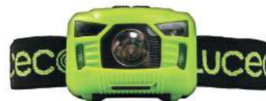
LED Inspection Head Torch (LILH15P65-02)

Three light modes. Control the beam for both short and long distance lighting needs. Easily recharge the battery with the included USB Type-C cable.