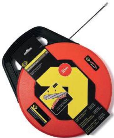
T5530 30metre Metal Draw Fish Tape

Combicutter 160mm. Combination Pliers 185mm. Snipe Nose Pliers 200mm.