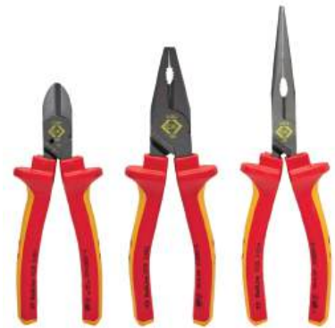
T3805 VDE Plier Set

The Knipex 03 06 Series Traditional Combination Pliers with multi-component grips, VDE tested up to 10,000V and safe for work up to 1,000V.