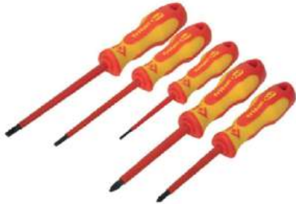
T4729 Triton VDE Screwdriver Set

The Knipex 03 06 Series Traditional Combination Pliers with multi-component grips, VDE tested up to 10,000V and safe for work up to 1,000V.